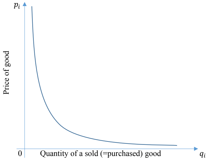
Figure 2. The 'curve of transactions' corresponding to the geometric mean index.

The obtained 'curve of transactions' has a very simple form. Namely, it is a symmetric hyperbola, depicted in Figure 2.